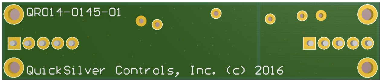
Bottom View of 2 DAC Board